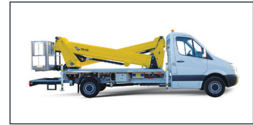
Low travel height