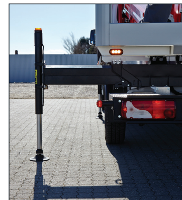
Compact H-frame outriggers

The photographs in this brochure are for promotional purposes only. Specifications are subject to change without notice.