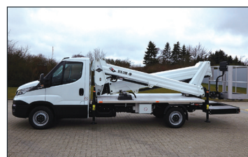
Also available on 3.5T GVW Iveco Daily 35S