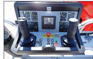
Easy to use full proportional (FPC) CANbus controls with display