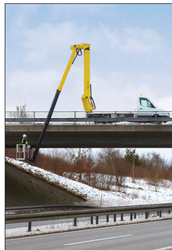
Ability to access below ground