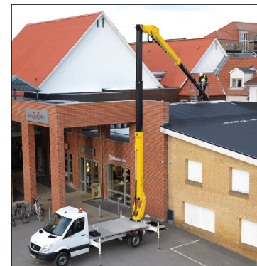
The ability to work over rooftops to access difficult to reach areas is aided by a flat bottomed basket